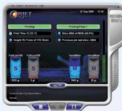
The System Display provides full visibility and control of the Eden printing system. It shows a progress bar, materials status indicators and printing time