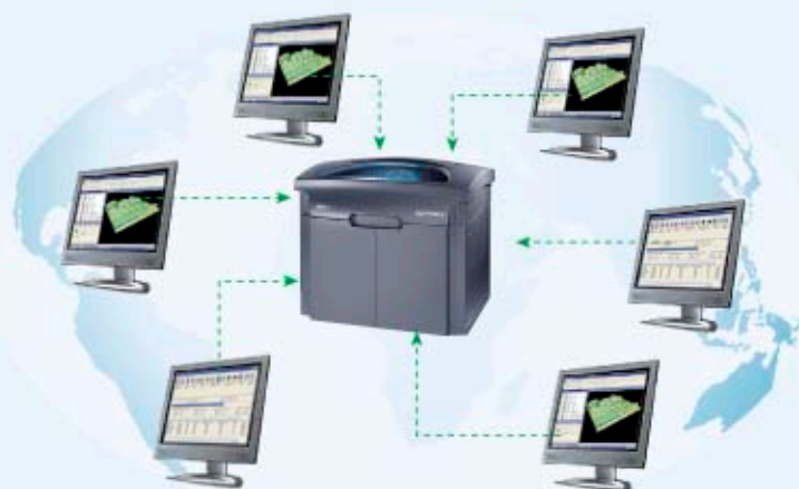
The powerful multi-user networking turns the entire facility into a highly productive and versatile 3-D modeling operation

In configurations of multiple Eden systems on the network, each user automatically receives the full parameters of the selected system, such as tray size, loaded materials, and queue status, ensuring easy, error-free tray setup.