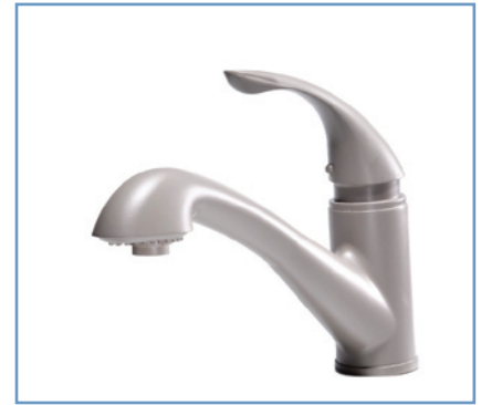
Figure 3. Metallizing the Objet model with a conductive surface

As described above, metal plating can be used for a number of reasons. Nickel plating is one of the most common used in decoration. When combined with an