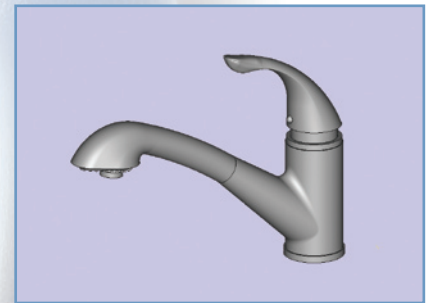
Figure 1. Faucet model design by CAD

The etch bath consists of a highly concentrated acid solution of chromic and sulfuric acid. The solution oxidizes selective areas on the Objet part. The holes produced by the oxidizing action are absorbing sites that hold small metallic particles that serve as activators for electroless plating. The hole size influences adhesion and other physical properties. After etching, the plastic is thoroughly rinsed.