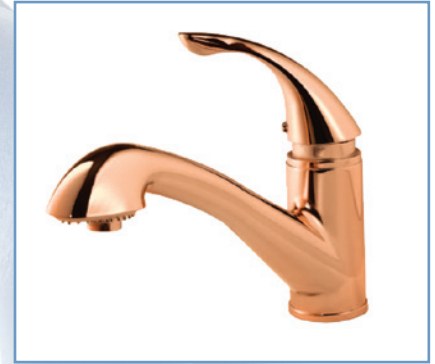
Figure 4. First coating of model with copper