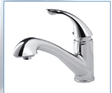
Figure 5. Final metal coating with Nickel